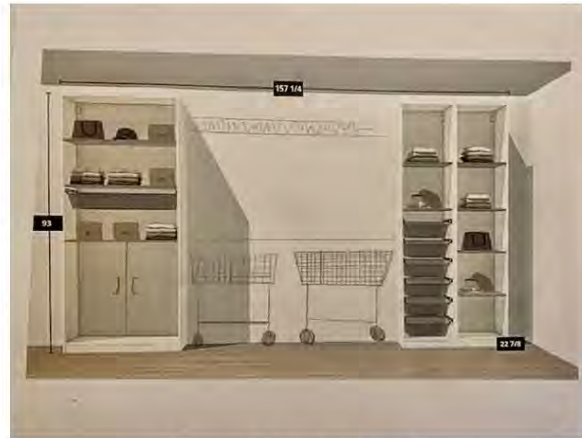
Proposed Donation Center