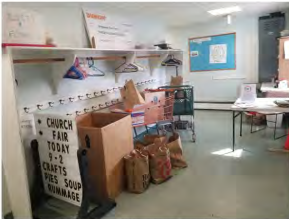
Current Donation Area

Central Square Congregational Church, United Church of Christ 71 Central Square Bridgewater, MA 02324