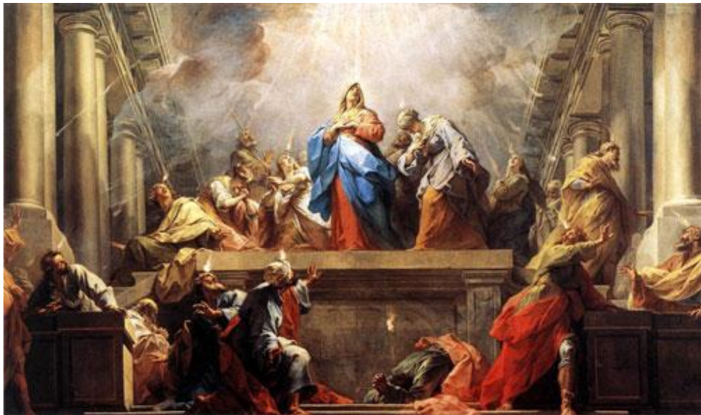
"Pentecost" by Jean Restout II, 1732.

For Christians, Pentecost is a holiday on which we commemorate the coming of the Holy Spirit on the early followers of Jesus. Before the events of the first Pentecost, which came a few weeks after Jesus' death and resurrection, there were followers of Jesus, but no movement that could be meaningfully called "the church." Thus, from an historical point of view, Pentecost is the day on which the church was started. This is also true from a spiritual perspective, since the Spirit brings the church into existence and enlivens it. Thus Pentecost is the church's birthday.